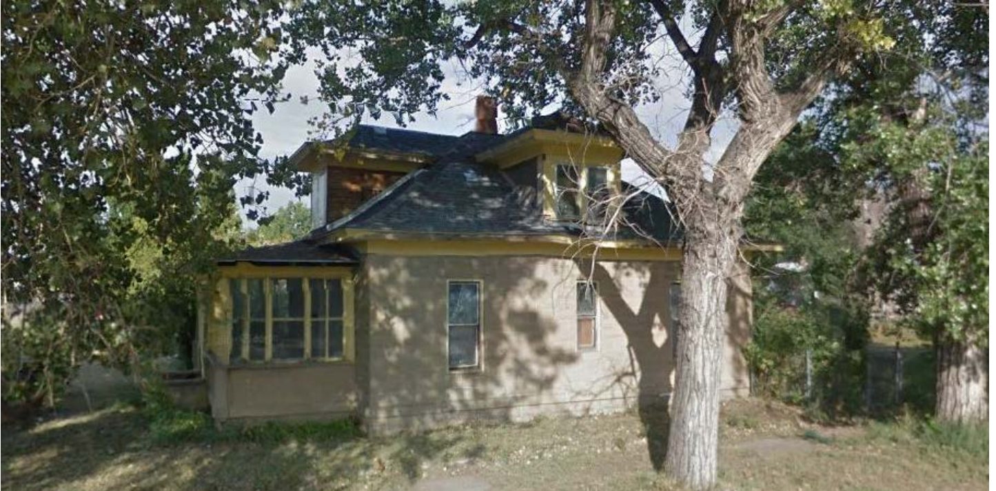
Dan Hurt House West elevation, facing east 8/13/15, (Google Earth Photo)