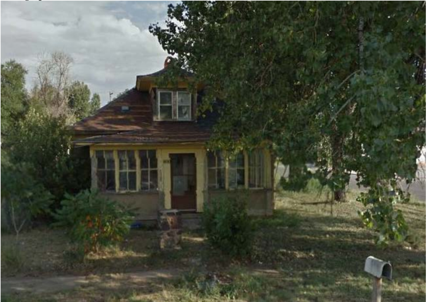
Dan Hurt House North Façade, facing south 8/13/15, (Google Earth Photo)