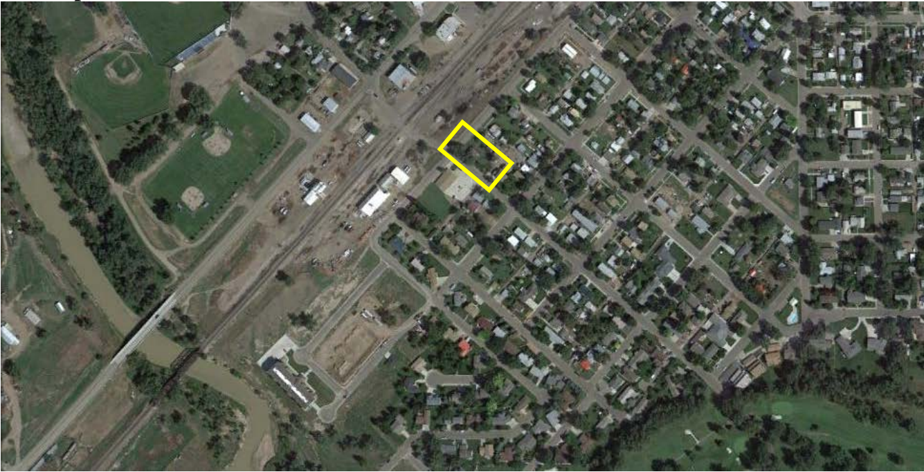
Dan Hurt House 400 Atlantic Ave, Miles City, MT T08 N R47 E S33 Google Earth Satellite Image 2015